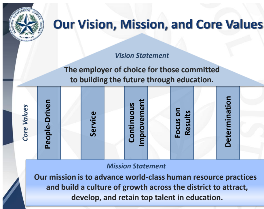
Figure 1: Human Resources Vision, Mission, and Core Values

HISD's Human Resources (HR) department exists to advance world-class human resource practices and build a culture of growth across the district to attract, develop, and retain top talent in education. Our goal is to make HISD the employer of choice for those committed to building the future through education.